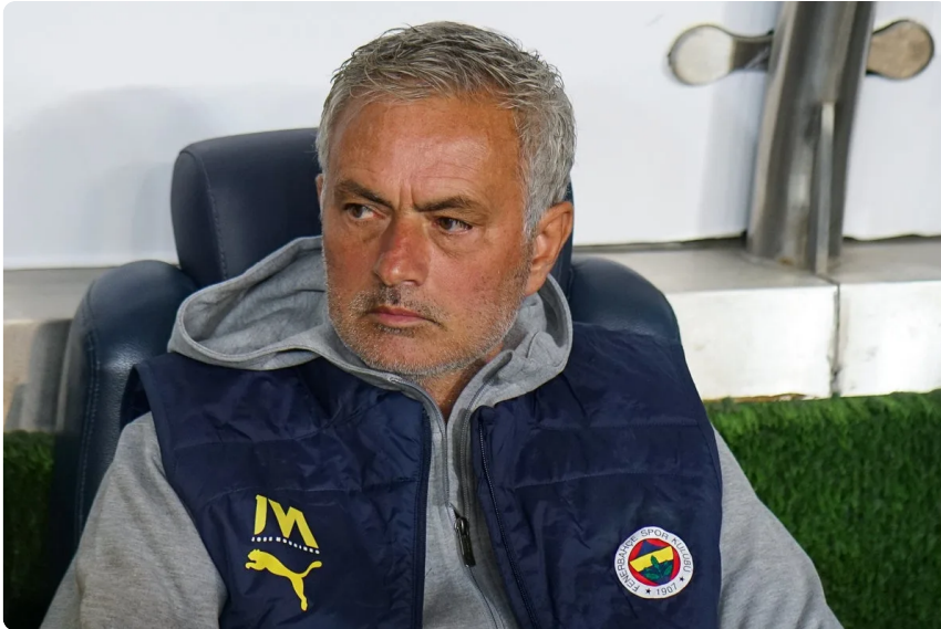
Jose Mourinho told to leave Fenerbahce amid Premier League return aim

Jose Mourinho has been told to leave Turkish football as 'The Special One' eyes a return to the Premier League .