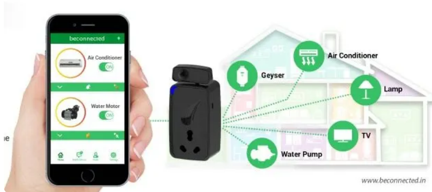
The Betty smartplug